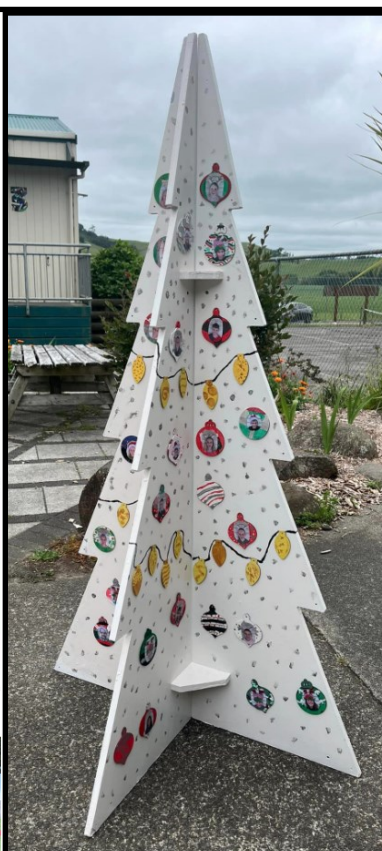
Christmas Tree Trail 2024 Destined for Main Street Te Awamutu