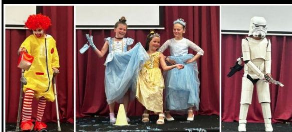
Book Character Day & Kiwi House Visit