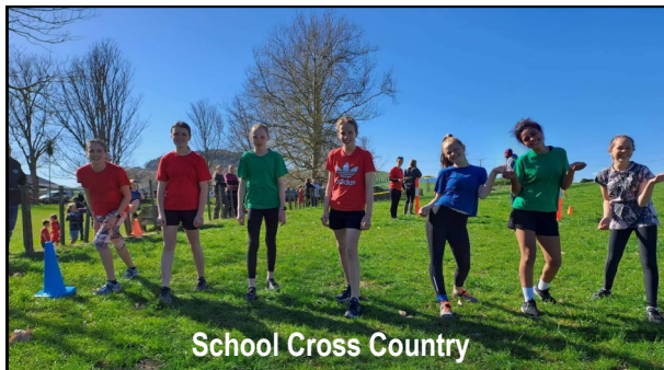
School Cross Country