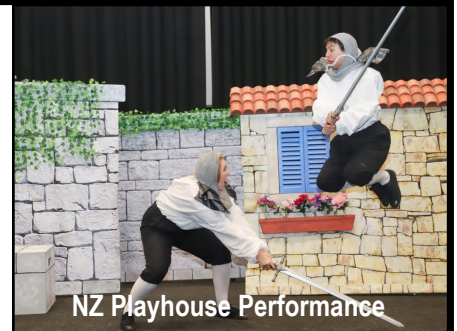
NZ Playhouse Performance