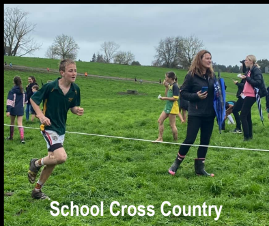
School Cross Country

This term we are looking forward to these annual events: