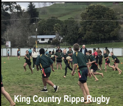
King Country Rippa Rugby